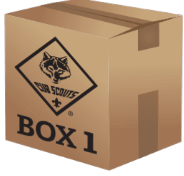
Everything to earn your Cub Scout's rank